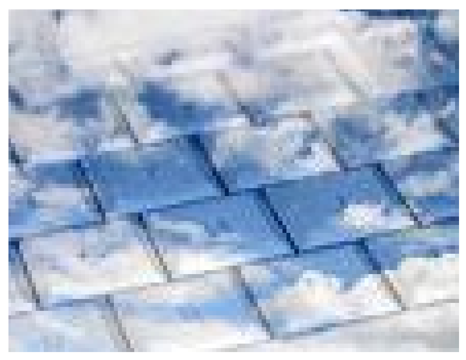
An enormous computing task made easier. A century ago, weather predictions were a dream. Today, weather predictions have broken the ten-day barrier. Behind this revolution are the invention of the radiosonde, plus spectacular progress in meteorological theory, numerical analysis and the power of supercomputers.