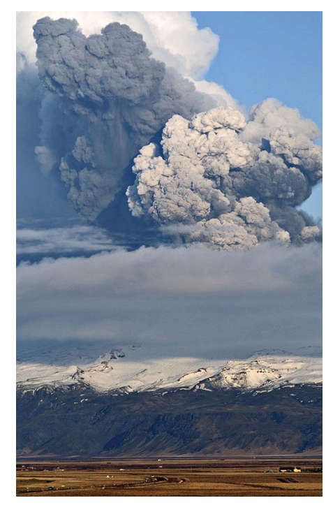
Protecting air traffic. With the recent eruption of the Icelandic Eyjafjallajokul volcano, many weather services cooperated to produce forecasts that helped airlines determine whether it was safe to fly in Europe. Ten million travelers were grounded when European airspace was closed for five days in April. Such volcanic ash advisory services are based on complex forecasting models.

Road ice prediction is based on models using forecasts of temperature, humidity, precipitation, cloudiness and other parameters to estimate road surface conditions. Applications exist